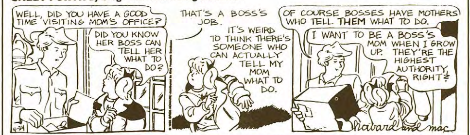
SALLY FORTH By Greg Howard and Craig MacIntosh

Watch for our next newsletter with an update on AAMI'S Annual Meeting and Exposition held in Boston, May 8-13, 1993. RPI will be there and come back with news to tell — especially about the SBET (Society of Biomedical Equipment Technicians) of the Year Award which RPI is proud to sponsor with AAMI by presenting the winner with a $500 check and an engraved plaque.